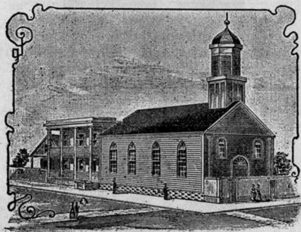
THE OLD CHURCH, ERECTED 1843