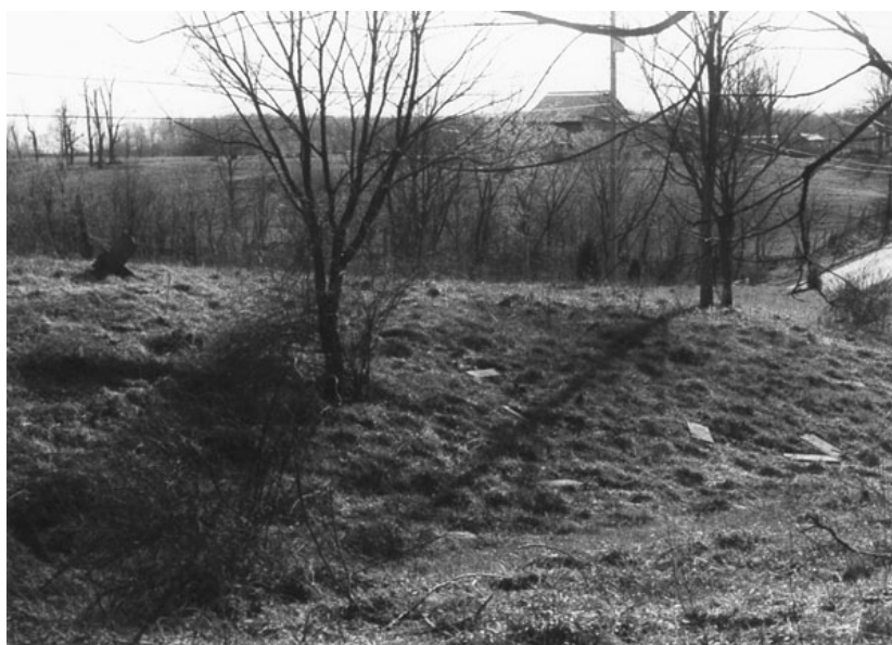
West end of cemetery. Many of the tombstones in this area lay flat with the ground.