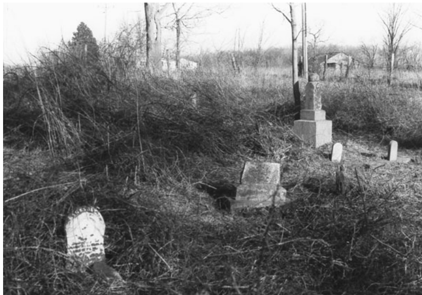
East end of cemetery. The tall marker to the right rear is that for Phebe (Loree) O'Brien Cunningham.